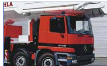
HLA units are available on all major commercial chassis with standard cab.