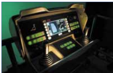
Bronto Skylift S 90 HLA has Bronto+ electronic control system. The control centers have full colour displays with excellent visibility.