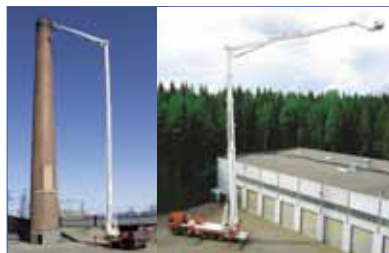
Combined horizontal and vertical reach.